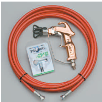
Part No: A3500-2-75 gun, hose and twist tip package (inc. tip)