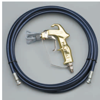
Part No: A7500-2-75 gun, hose and twist tip package (no tip)